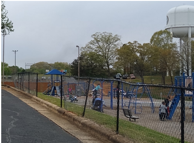
The photo above, also made on April 17, 2021, shows boys and girls playing on the playground. Contrast it with the one below made on Sunday, July 19, 2020, when all playgrounds were closed by executive orders.